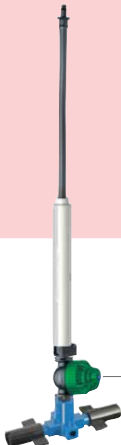
Super LPD (medium pressure)

For optimal cooling or humidifying of greenhouses