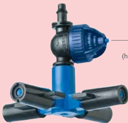
Super LPD (high pressure)